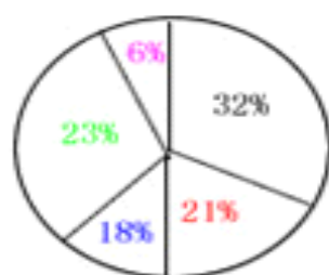
v119 rate of Europe people' leisure time

32%—watch tv 21%—talking with friend 18%—talking with family 23%—go to restaurant 6%—other